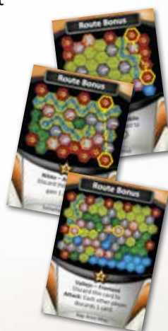
Route Bonus Cards