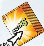
Player B's Deck