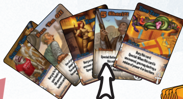
Player A's Hand