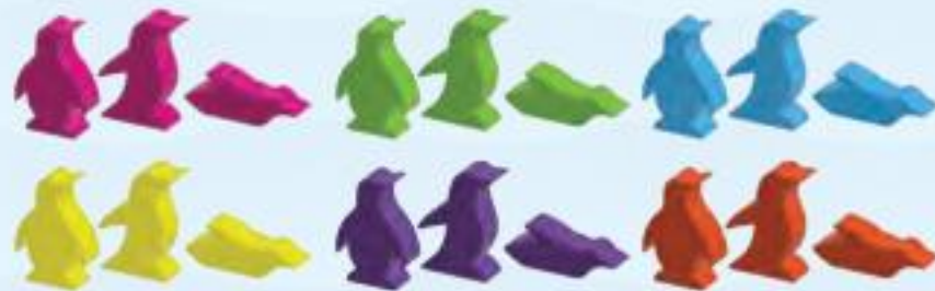
Penguins - 3 each in 6 player colors