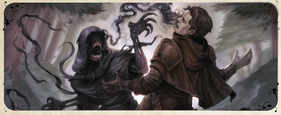
DIFFICULTY: MODERATE COMPLEXITY: MODERATE - COMBATIVE

You may replace Silent Temple with Monument Park (35) if you don't want a Combative setup.